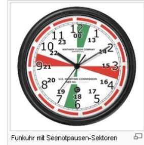
Funkuhr mit Seenotpausen-Sektoren