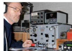
"QRZ? DDH47 QSX 3565 k"