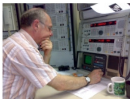
" Is it Morse code ? "