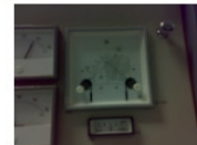
" Full Power 20 kWatt"